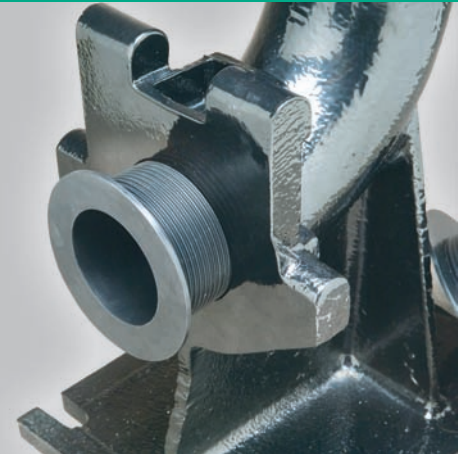
Presses Into Place