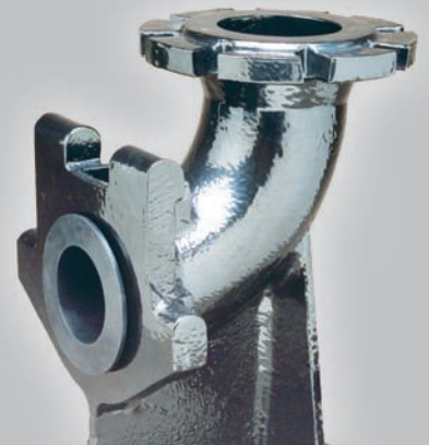
Provides Absolute Seal