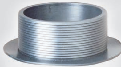
Unique POWER-THREAD™ design simply pushes into place. No glue required and no set-up time.

The Elbow Saver is easy to install because the unique POWER THREAD™ design allows you to just press it into place. The POWER THREAD design holds the Elbow Saver in place without the need for gluing or wasteful glue-related set-up time. Its fast, easy, and absolutely